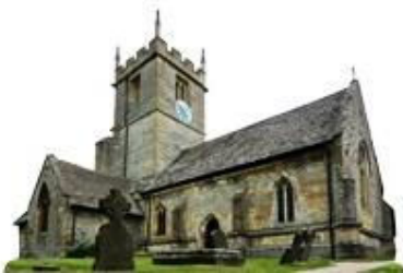
Hampton - Fairfield - Thistledown Eastwick Park - Charity Crescent